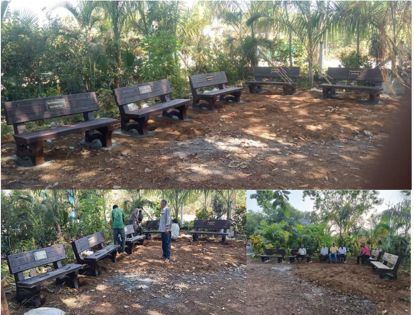
Actual Benches Placed on temple ground