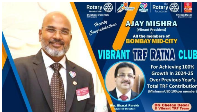
RCBMC become EREY club with 100% growth in TRF over last year.

Big thanks to TRF director: Bharat Parekh